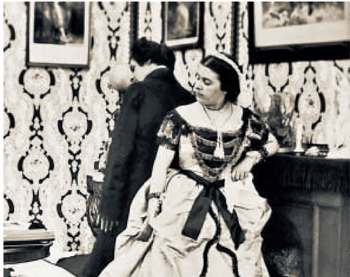
PART OF THE FURNITURE Victorian women and their children were regarded as their husband's chattels

To order books at discounted prices and with free p&p call 0845 2712134